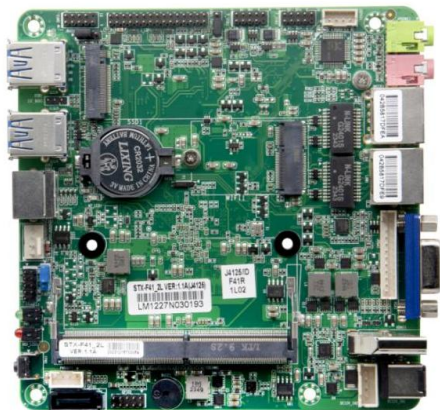
STX-F41_2L VER:1.1A 正面图