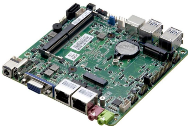
STX-F41_2L VER:1.1A 侧面图