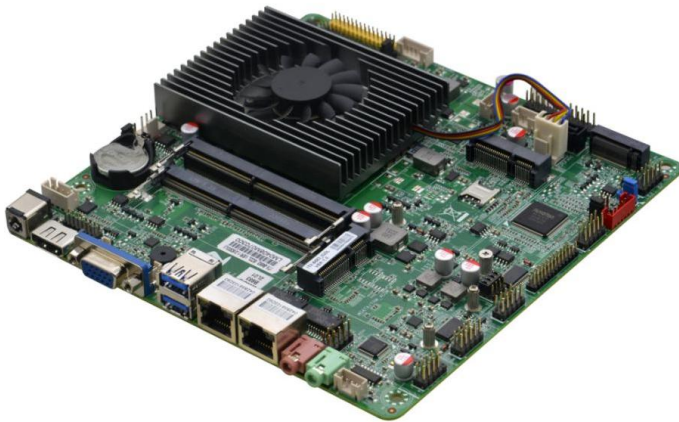
ITX-B683_I522L VER:1.0 主板侧面图