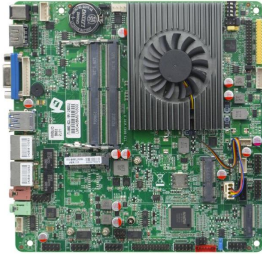
ITX-B683_I522L VER:1.0 主板正面图